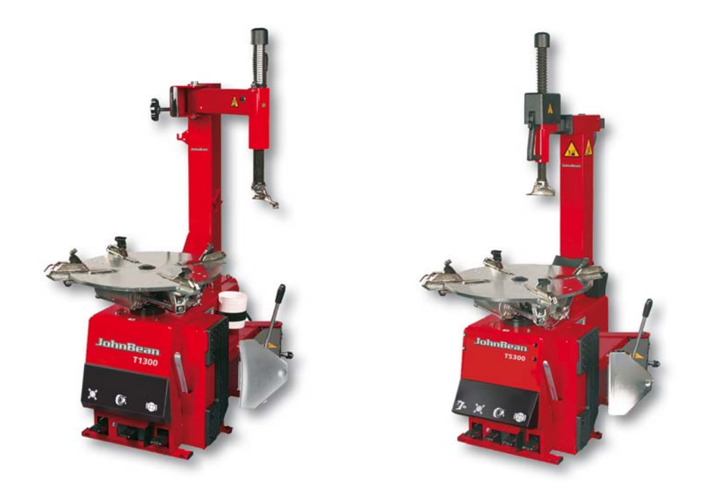
TABLE-TOP TYRE CHANGERS OF T1300 / T 5300 SERIES