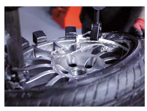
OPTIONAL SMART BEAD SPACER

For mounting UHP and run-flat tyres. The Smart Bead Spacer comes standard with the plus kit.