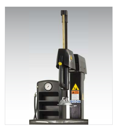
PNEUMATIC VERTICAL ARM

Fast and ergonomic: the pneumatic vertical arm facilitates positioning of the mounting head on all wheels (Serie T5540 2S).