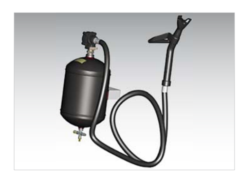
TOP-SIDE BEAD SEATER

The plus models are certified by wdk. They come standard with MH 320 pro and plus kit that enable the correct mounting and demounting of UHP and run-flat tyres.