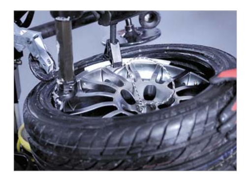
SIMPLE Gentle demounting with the bead pusher.