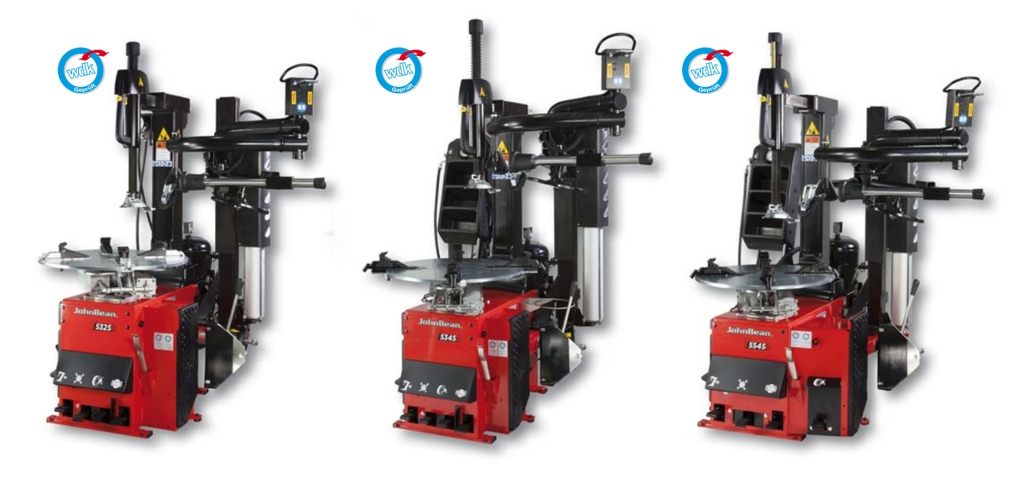
TABLE-TOP TYRE CHANGERS WITH PROspeed TECHNOLOGY