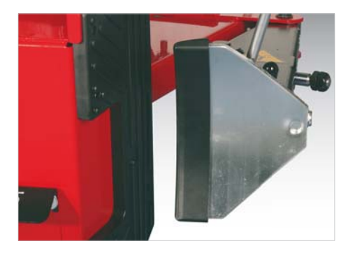
BEAD BREAKER BLADE

Owing to its special shape the bead breaker blade handles rims most gently and facilitates operation considerably.